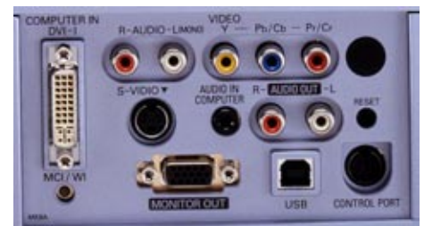
Input / Output Terminals