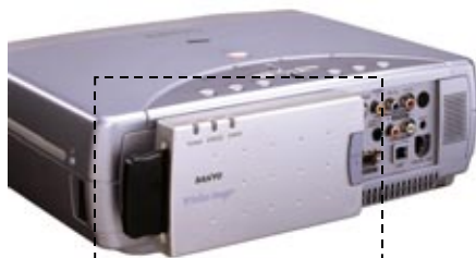
Optional Wireless Imager (POA-WL11) (Includes 1 wireless LAN card for projector)

Because its products are subject to continuous improvement, SANYO reserves the right to modify product design and specifications without notice and without incurring any obligations.